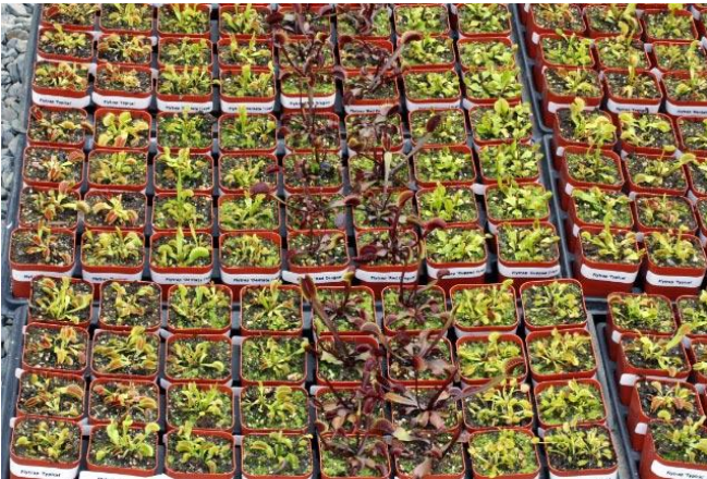
Assorted Venus Flytraps; 2.5" pots