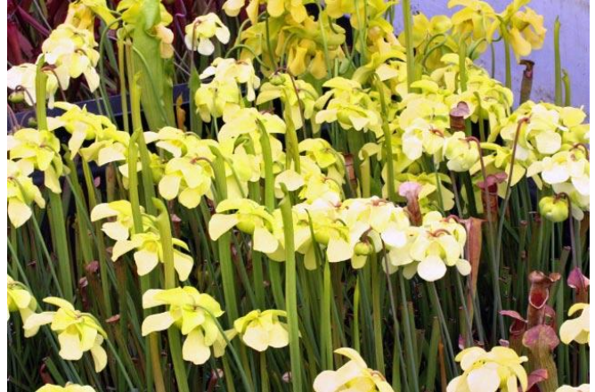
Sarracenia alata - in bloom