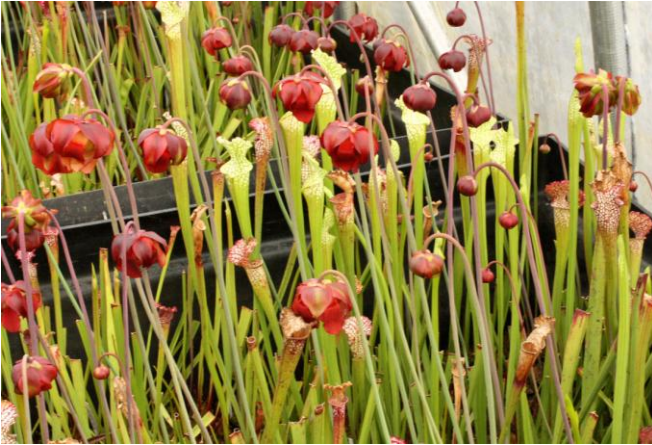
Sarracenia leucophylla 'Tarnok' - tall 12"

Appearance can vary depending upon the season.