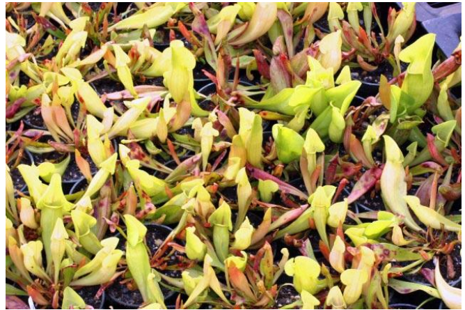
Sarracenia 'Carolina Yellow Jacket'