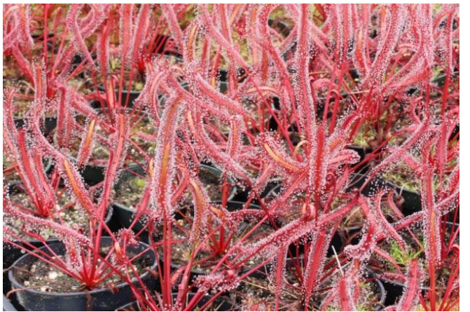
Nepenthes ventricosa (above) Nepenthes sanguinea (below) Drosera capensis 'red' Pinguicula primuliflora (below)